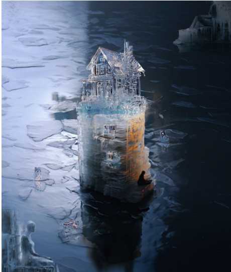
Xinyi Fang Fashion