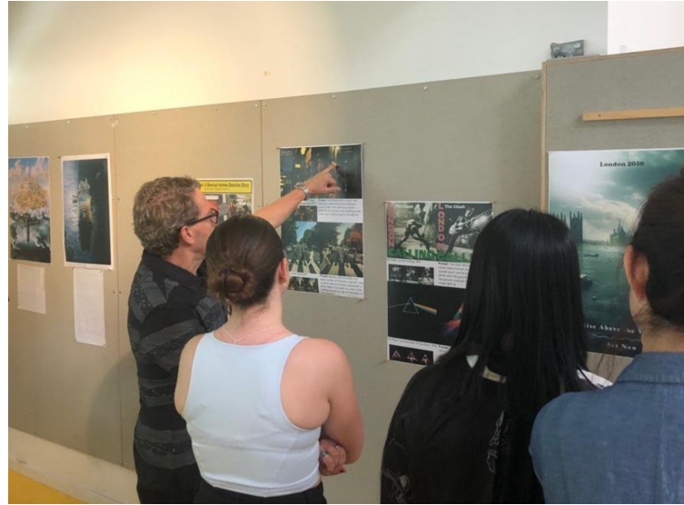
Maya Gallo Creative Industries