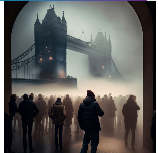
AI generated - london bridge

For more information, visit the Spring/Summer OSAP page. If you have any questions related to OSAP, contact the Student Financial Assistance Department by phone at 416-979-5036.