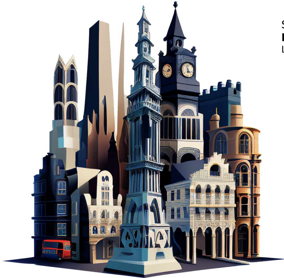
AI generated illustration of London