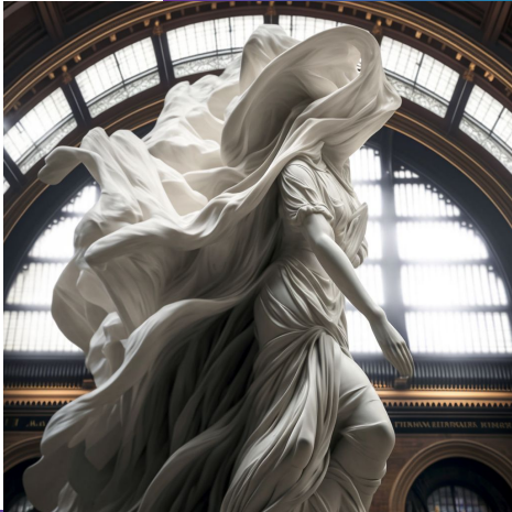
AI generated - sculpture in St. Pancras Station

The Passport Fund provides funds to students taking part in university-approved international activities.