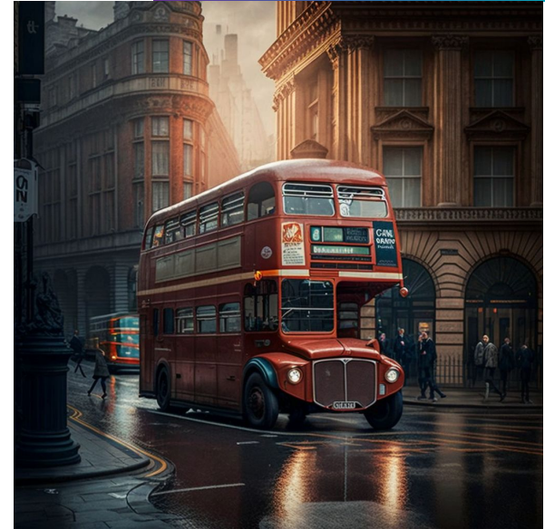
AI generated - streets of London