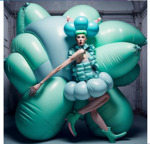
AI generated - inflatable fashion